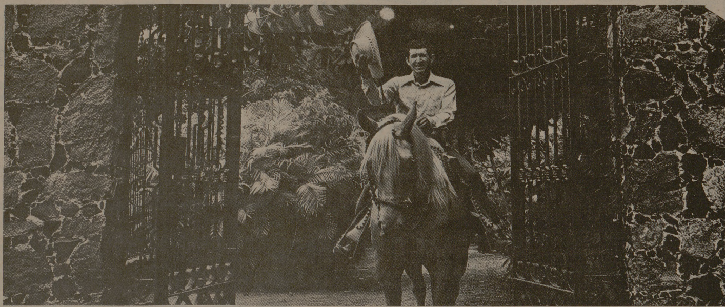
Next time you're in Mexico, stop by and visit the Cuervo fabrica in Tequila.

Since 1795 we've welcomed our guests with our best. A traditional taste of Cuervo Gold.