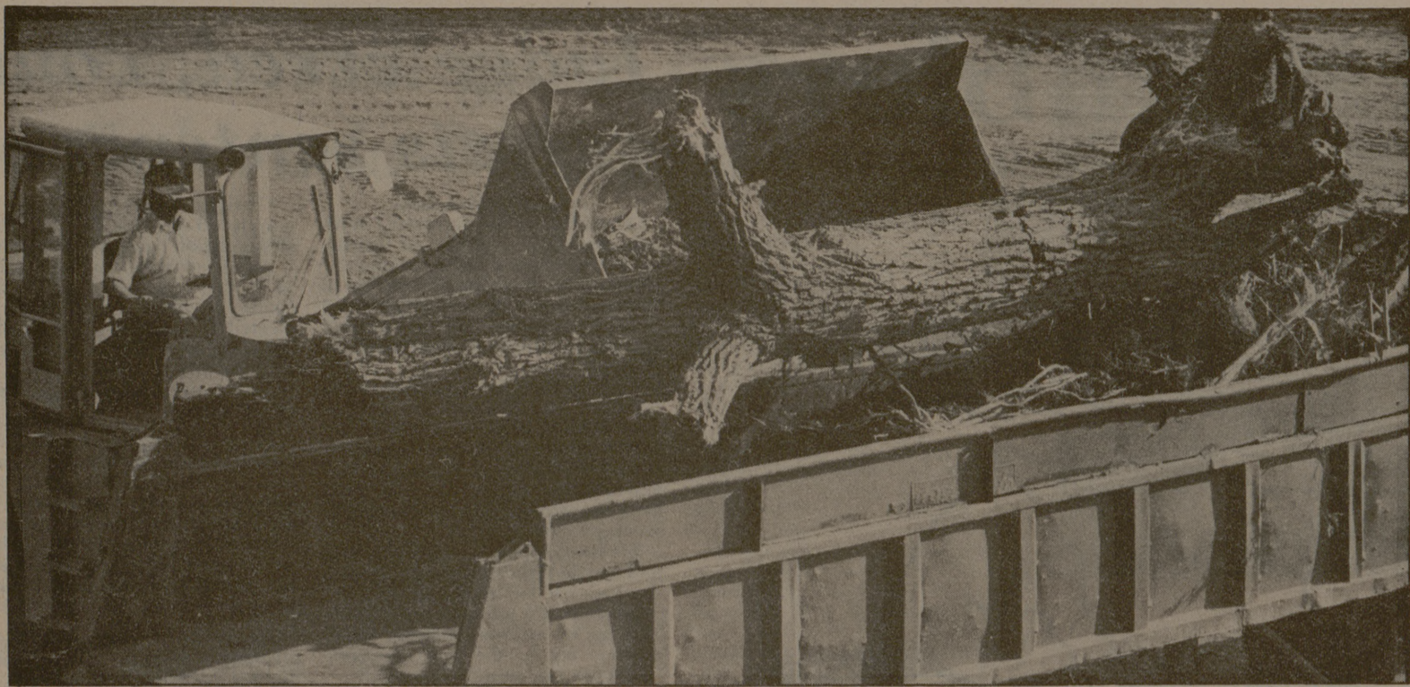
Beginning the new dormitories

The land beside Hotard Hall is undergoing a facelift in preparation for the construction of more new female dormitories.