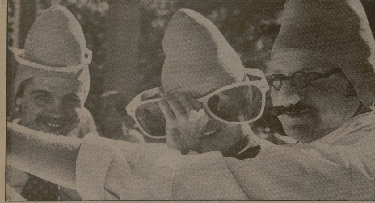
The Halloween costume contest at Sbisa dining hall brought out every form of character from the bizarre, above top, to the familiar