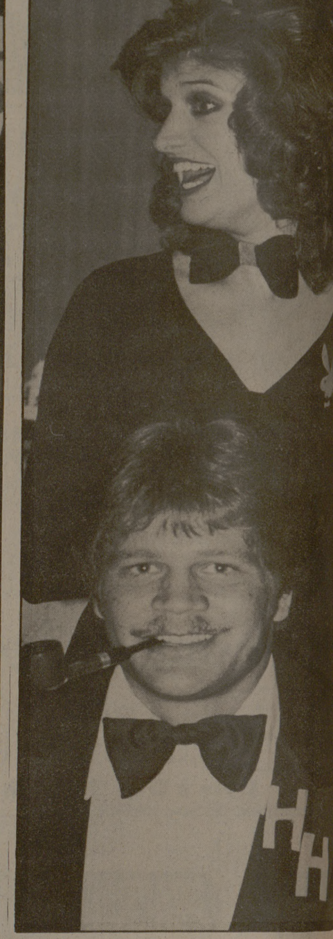
There's room for love at Halloween too, as both the hunchback and Playboy bunny above tes