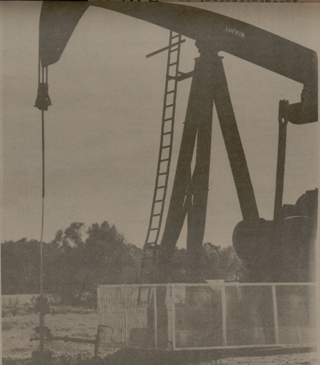
Oil pumps are a familiar sight since drilling in Kurten began four years ago.

"I've had a little trouble with oil spills," one man said. "But they were willing to do right by it. They're nice people, but they're a big industry and they can't get everything done all at once."