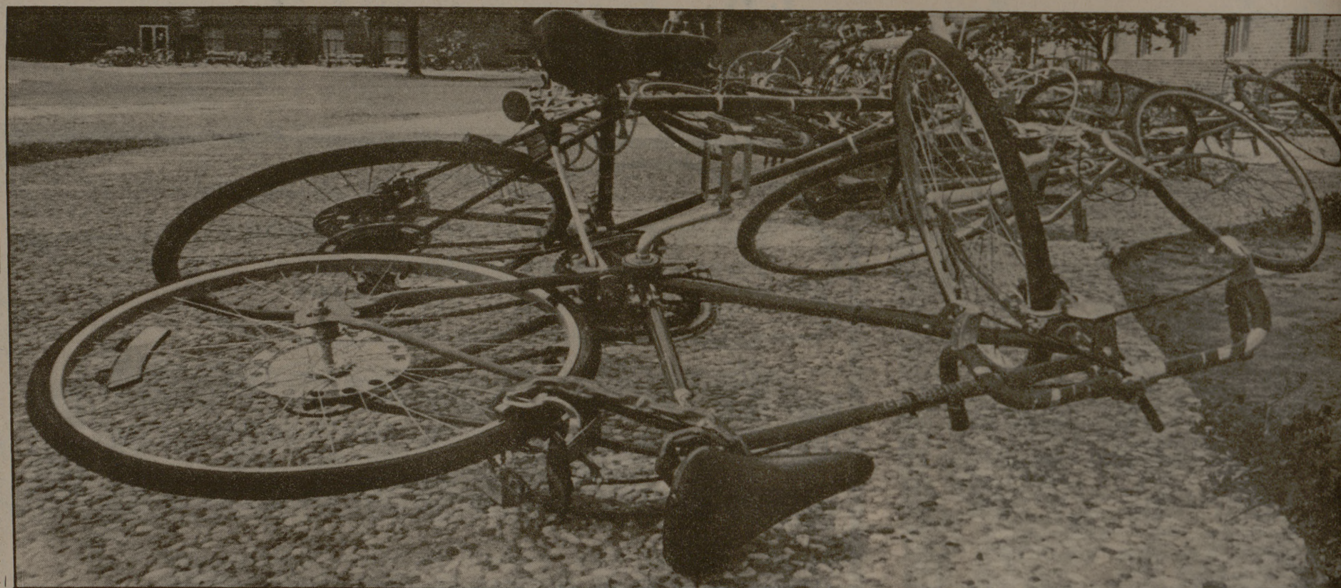
'Gone with the Schwinn'

Besides just being responsible for messed-up hairstyles and watery eyes, the strong winds blowing across campus lately proved especially destructive to parked bicycles. Those bikes parked adjacent to other bikes were most often damaged. If they did not get them directly, a toppled bike next to them often did.