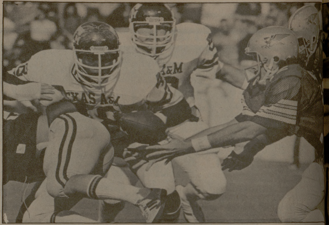
'I seem to have forgotten something!'