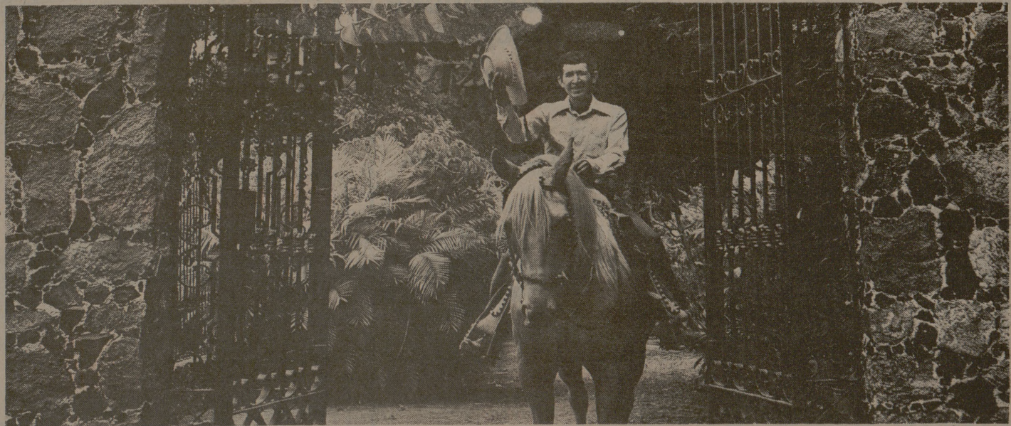
Next time you're in Mexico, stop by and visit the Cuervo fabrica in Tequila.