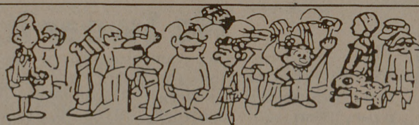
Day students get their news from the Batt.

Hours Open 11:30-Mon.-Sat. CULPEPPER PLAZA Noon on Sunday Closed 10:30 Mon.-Thurs. 693-6948 11 P.M. Fri. and Saturday