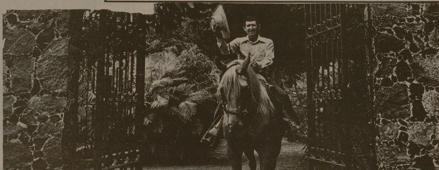
Next time you're in Mexico, stop by and visit the Cuervo fabrica in Tequila.

Since 1795 we've welcomed our guests with our best. A traditional taste of Cuervo Gold.