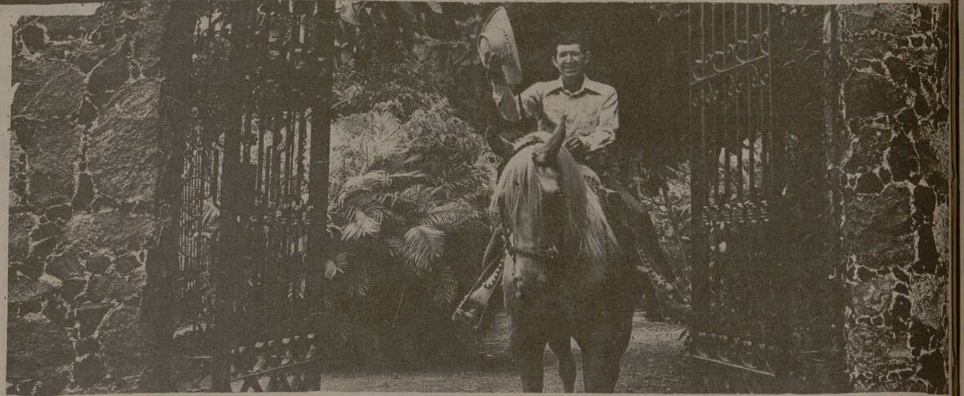
Next time you're in Mexico, stop by and visit the Cuervo fabrica in Tequila.

Since 1795 we've welcomed our guests with our best. A traditional taste of Cuervo Gold.