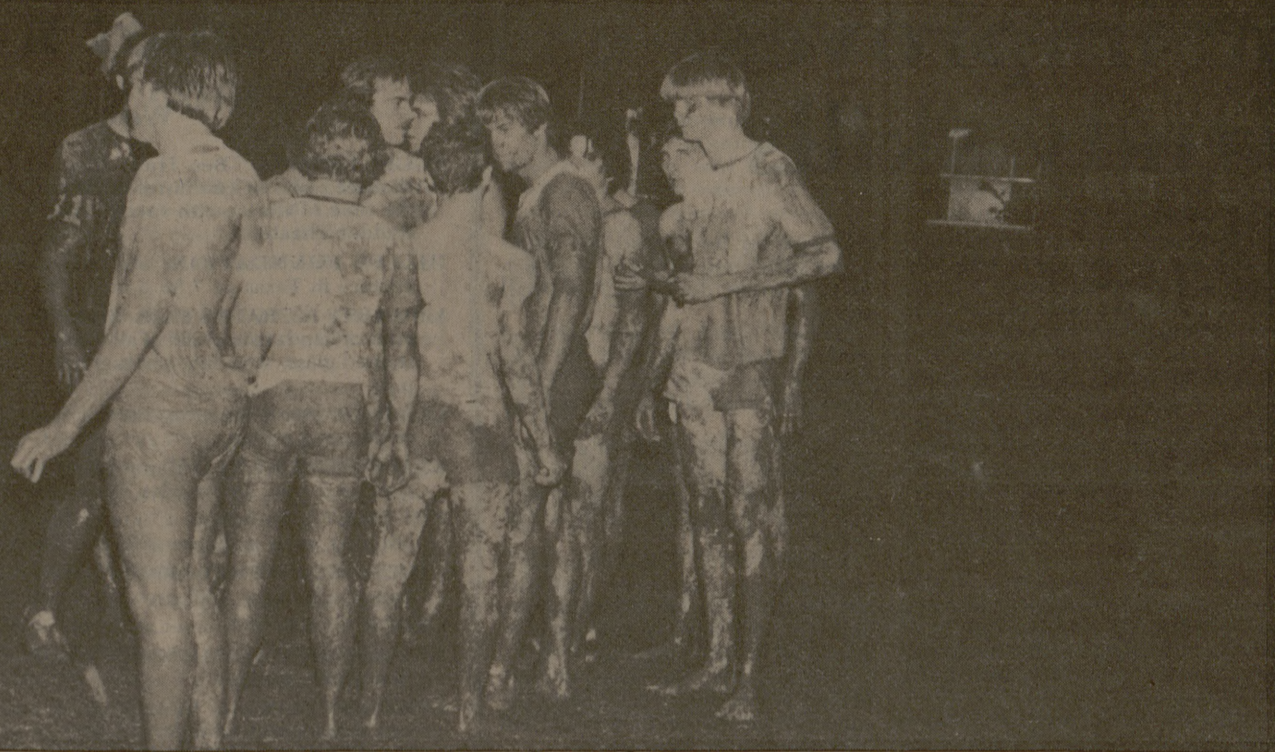
...but how you play the game

Members of Moses and Davis-Gary dormitories used the rain to their advantage in organizing a mud football game on a makeshift, or mushift, gridiron.