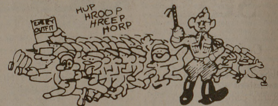
The Corps of Cadets gets its news from the Batt.

Booking on the flights is available through travel agents.