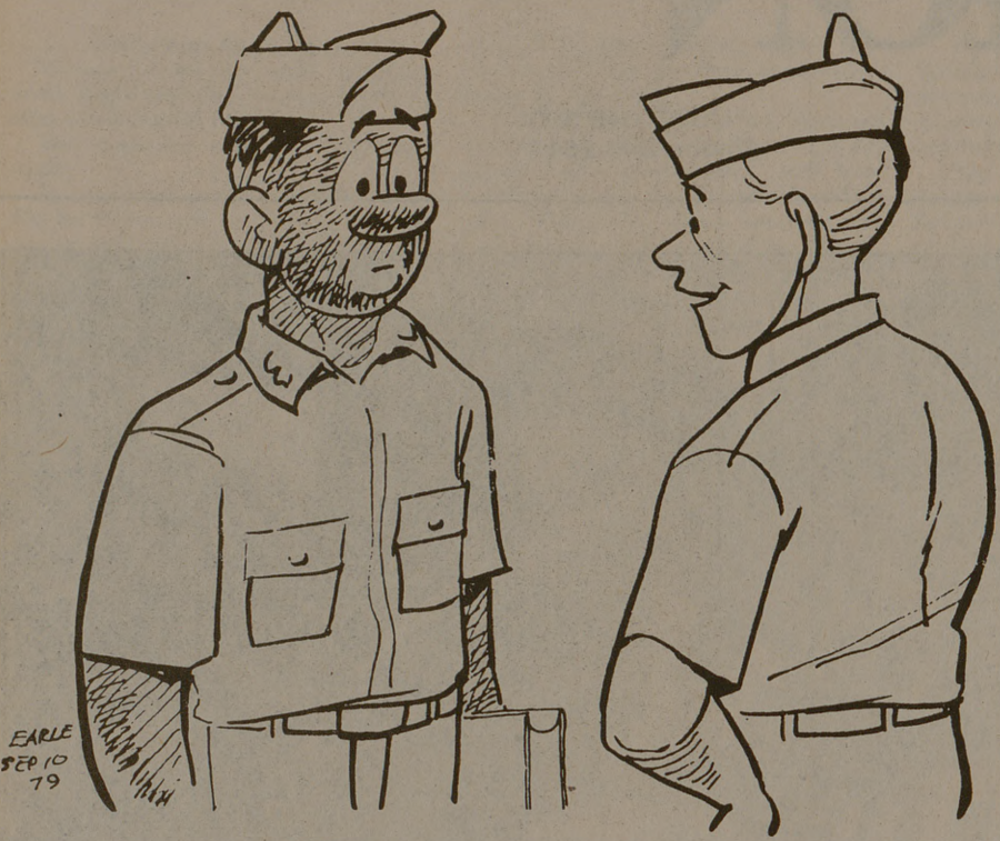
"I heard you made a swing by Padre Island for a swim."