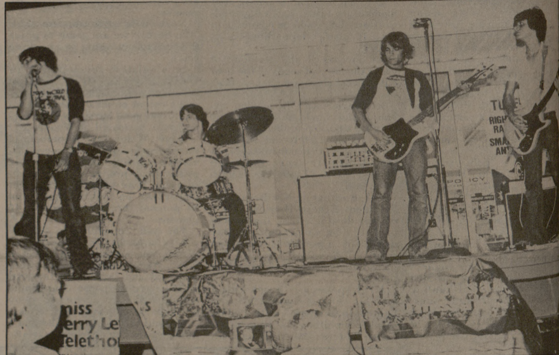
Cambridge, a local band, played mostly rock 'n roll music and got many a foot stompin'.