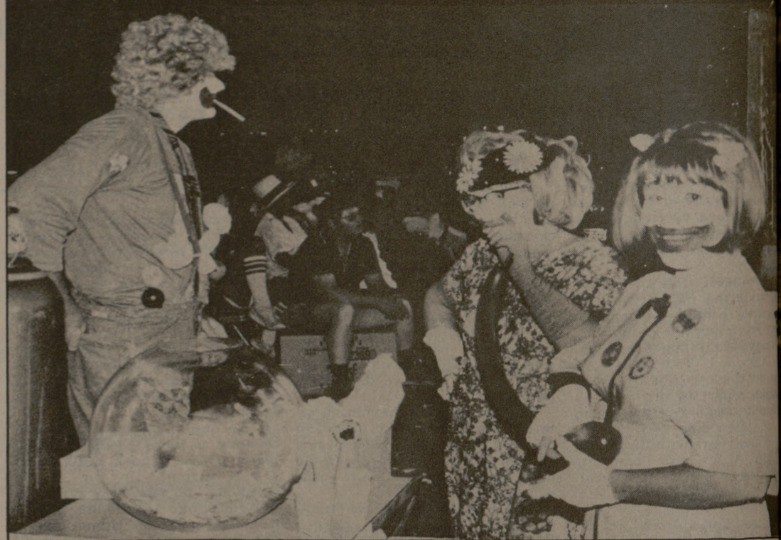
These MDA clowns handed out balloons and entertained people all day to get more donations, which totalled $1,200.

There was a lot of foot stompin' and hand clappin' going on at the K-Mart store on Texas Avenue in College Station, Saturday. The cause of all the excitement was the