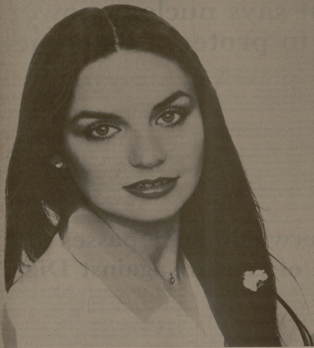
Crystal Gayle to play A&M

Country and blues singer Crystal Gayle will perform at Rudder Auditorium Thursday at 8:30 p.m. This is the first time a summer concert has been presented at Texas A&M. Crystal Gayle is known for several hits including "I'll Get Over You," "Don't It Make My Brown Eyes Blue," and "Somebody Loves You."