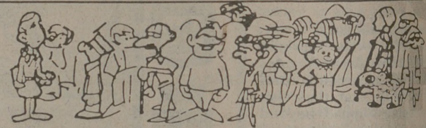
Day students get their news from the Batt.

In the computer rankings, Connors jumped from 55 to 31 and reached the final of the WCT tournament at River Oaks in Houston last week. That took the two-titled player from New York into the seventh seed — behind Borg — at the Masters of Australia. It assured Masters of Connors in the opening round instead of Borg. Upon hearing the switching partners from Borg to Connors, Masters remarked, "It's blaring from the frying pan to the fire."