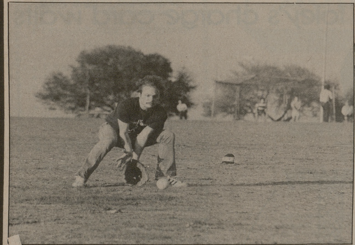
Look! There goes another one. Not the softball but another Aggie proudly wearing his Intramural champion's T-shirt. Softball is presently in playoffs and with the weather's cooperation we should finish up by May.