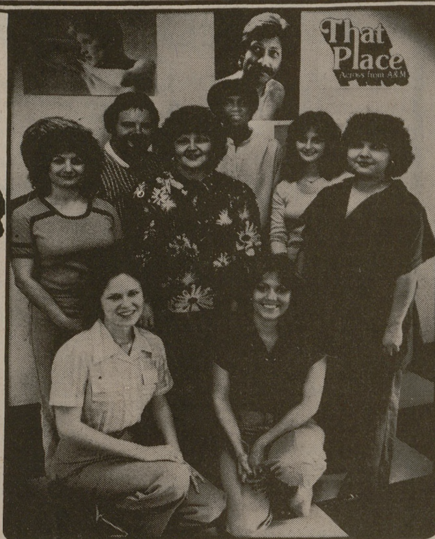
Our Place is That Place