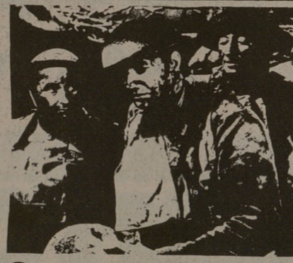
Sergeant York rated G