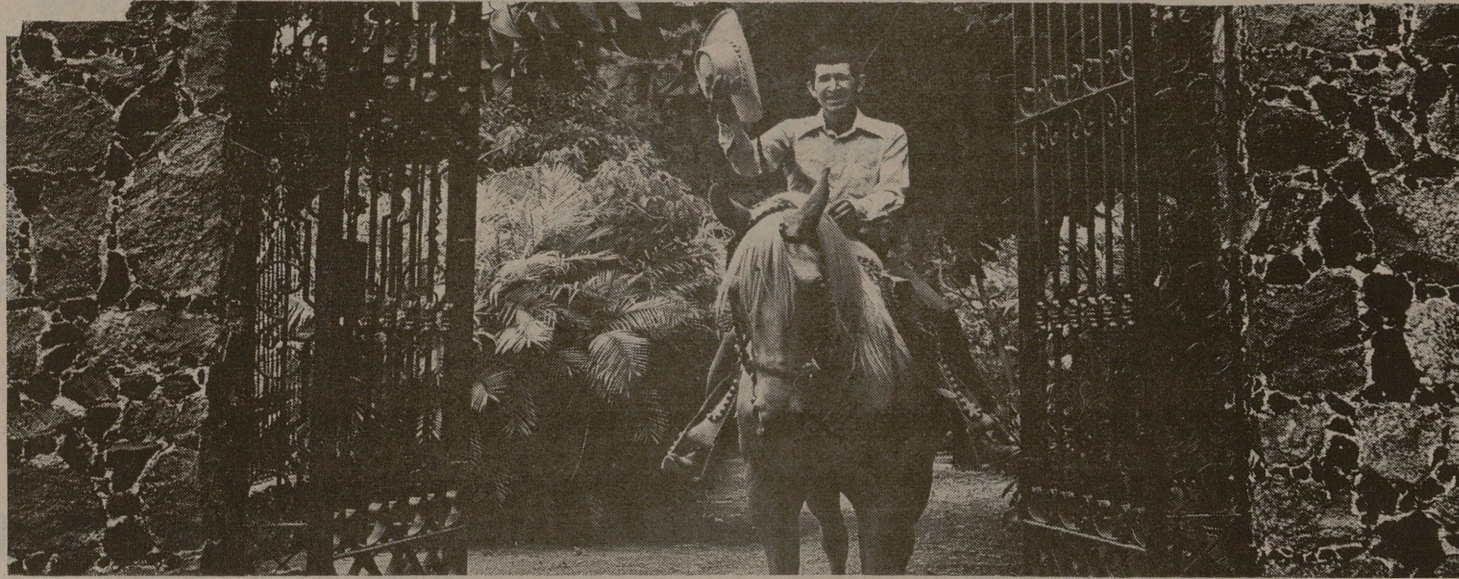
Next time you're in Mexico, stop by and visit the Cuervo fabrica in Tequila.

Baylor was a willing assistant to the fiery Van Breda Kolff from 1974 to 1976. He took command in the middle of the 1976-77 season and the Jazz finished the season with a 35-47 record. New Orleans missed the playoffs by two games in 1977-78 with a 39-43 record, then struggled this year with Maravich on the sidelines for nearly half the year.