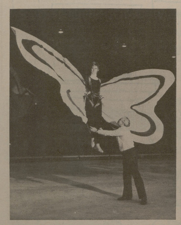
Ice Capades performers