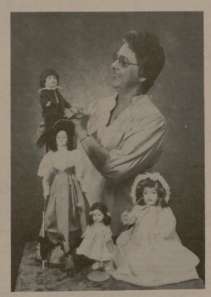
Kerrville arts and crafts

WACO: A full program of amusements for children has been set up for the Brazos River Festival's "Happy Place," which will be held April 28 and 29 from 11 a.m. to 7 p.m. "Happy Place" is specially designed to amuse children with games, animals, puppet shows and other colorful and enjoyable things, while their parents can browse through arts and crafts displays. There will be plenty of food also, for parent and child alike. Admission is $2.50 for adults and 50 cents for children under 12. For more information call 817-776-3748.