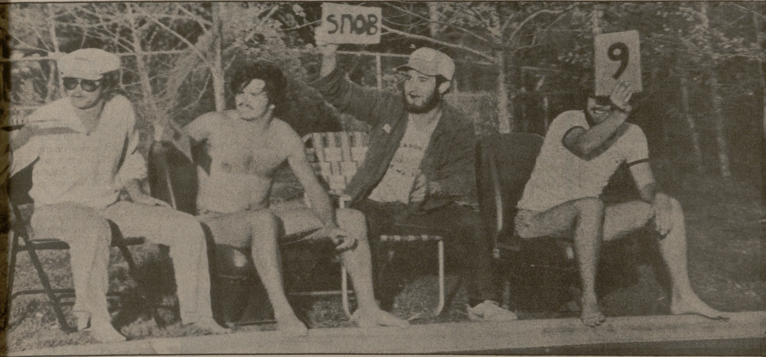
Judges give priceless expertise