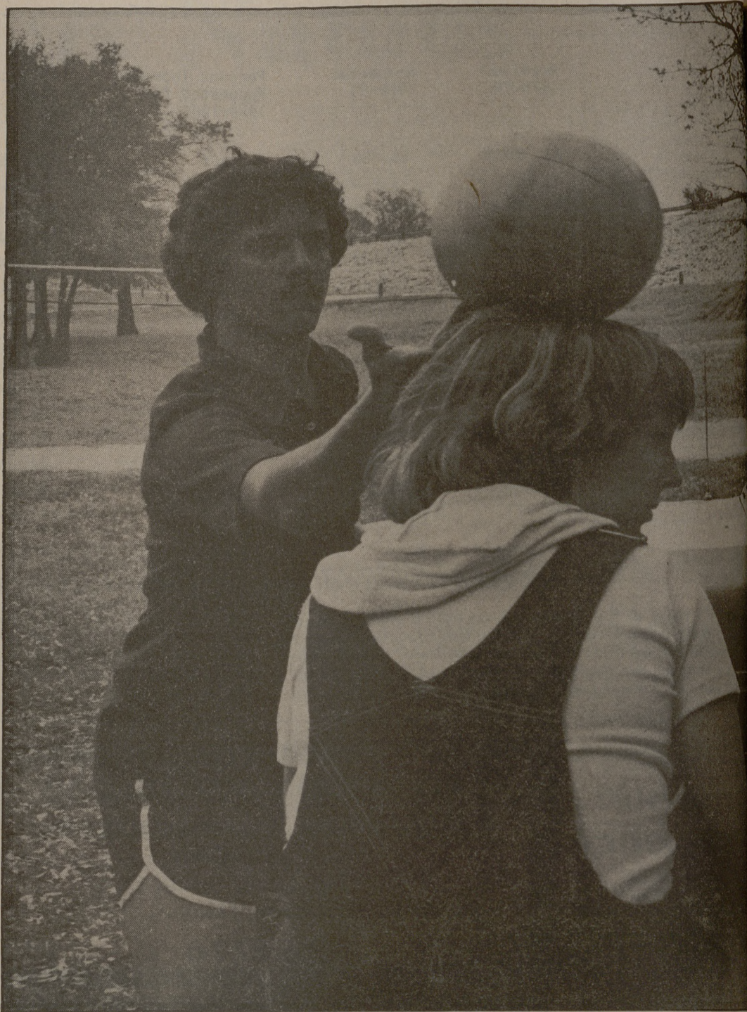
Please, no sudden moves

Students who are interested in the trip may contact Political Forum in Room 216 of the MSC.