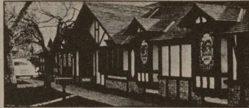
Our new place 2401 Texas Ave. Bryan 779-2431

LIVE MUSIC — Fri., Sat., Sun. playing your songs by request.