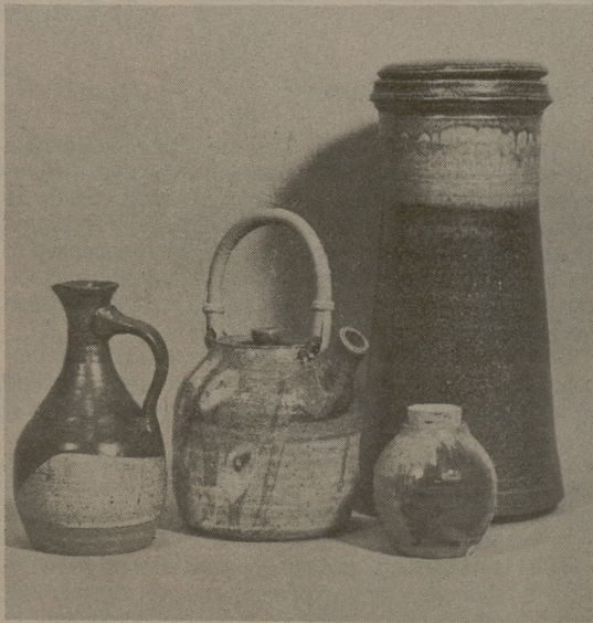
Pottery from the Star of the Republic Museum near Navasota.

POMPEII: The museum staff will be busy in April restoring the eight galleries used to house the Pompeii AD 79 exhibit, and a permanent collection will be installed by the opening date of May 2. Until then, the pre-Columbian and African Galleries will be open, along with the museum shop. Hours are Tuesday through Saturday, 10 a.m. to 5 p.m.; Sunday, 1 p.m. to 5 p.m.; closed Monday. For more information call 214-426-2553.