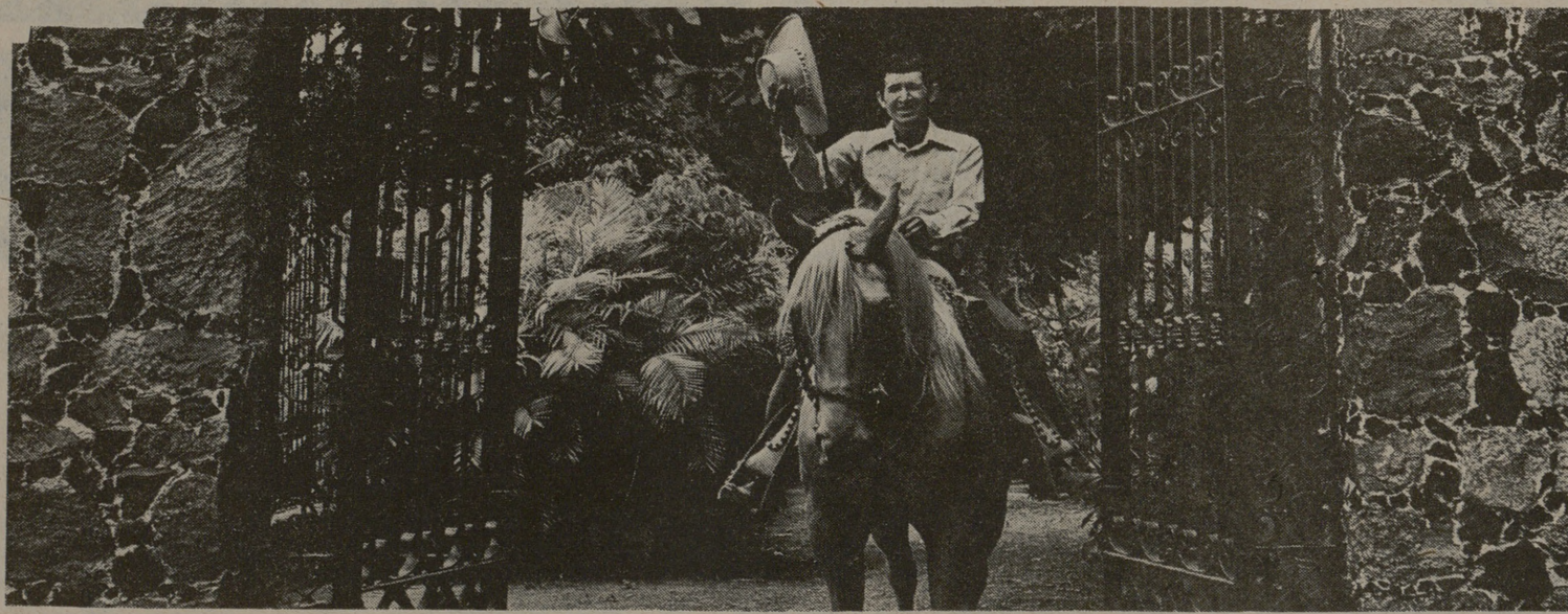
Next time you're in Mexico, stop by and visit the Cuervo fabrica in Tequila.

Since 1795 we've welcomed our guests with our best. A traditional taste of Cuervo Gold.