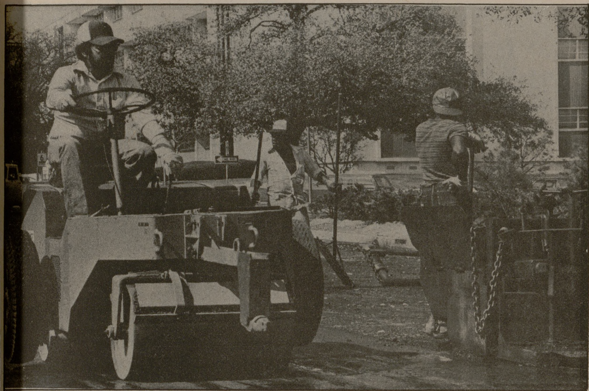
Making road while the sun shines

Workmen last week took advantage of sunshine and absence of students to re-asphalt