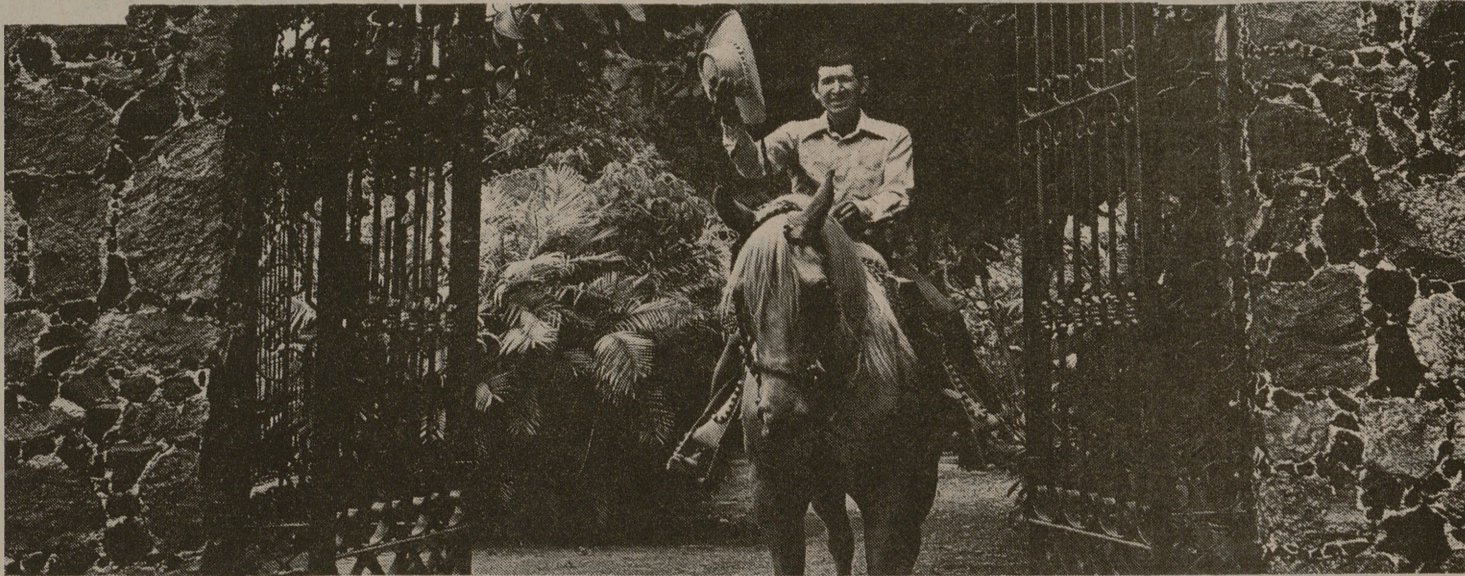
Next time you're in Mexico, stop by and visit the Cuervo fabrica in Tequila.

Up in Richfield, near Minneapolis, she said there is still a foot of snow on the ground.