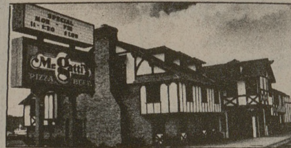
Our place in University Square College Station 346-4109

LIVE MUSIC — Fri., Sat., Sun. playing your songs by request.