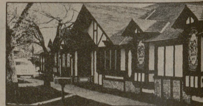
Our new place 2401 Texas Ave. Bryan 779-2431

LIVE MUSIC — Fri., Sat., Sun. playing your songs by request.