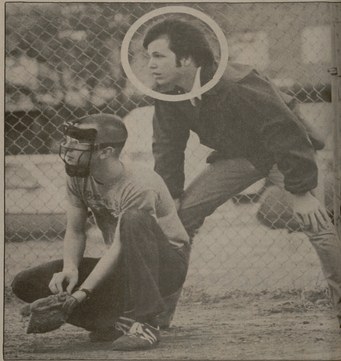
"I-Spy" Participant of the Week