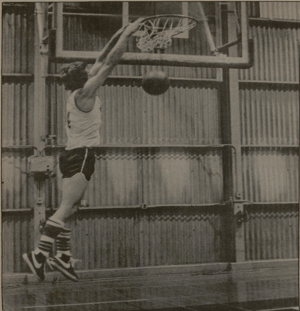
Swoosh! is a sound often heard at slam-dunk contests. This is a scene from last year's contest. Watch for the dates for the finals in