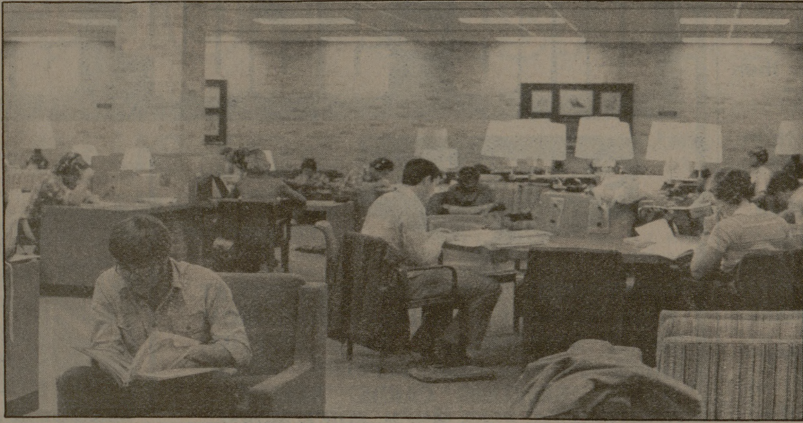
Texas A&M University Browsing Library on the second floor of the Memorial Student Center is quite crowded in mid-afternoon.