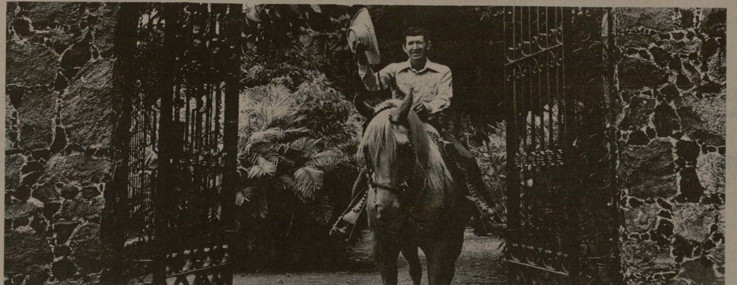
Next time you're in Mexico, stop by and visit the Cuervo fabrica in Tequila.