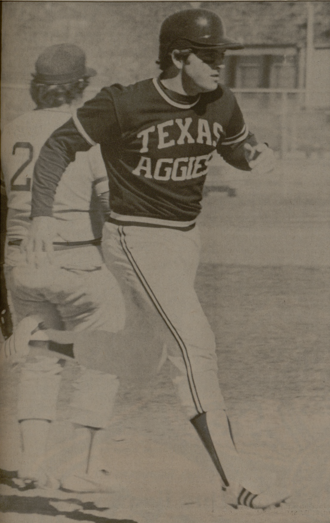
A run in the sun

The 15 teams in the tournament, which starts Sunday at 8:30 a.m., will be SMU, Tulsa, Texas, Texas A&M, Houston Baptist, Lamar, Memphis State, Midland College, Oklahoma, Oklahoma State, Sam Houston State, Stephen F. Austin, Temple Jr. College, TCU and Texas Tech.