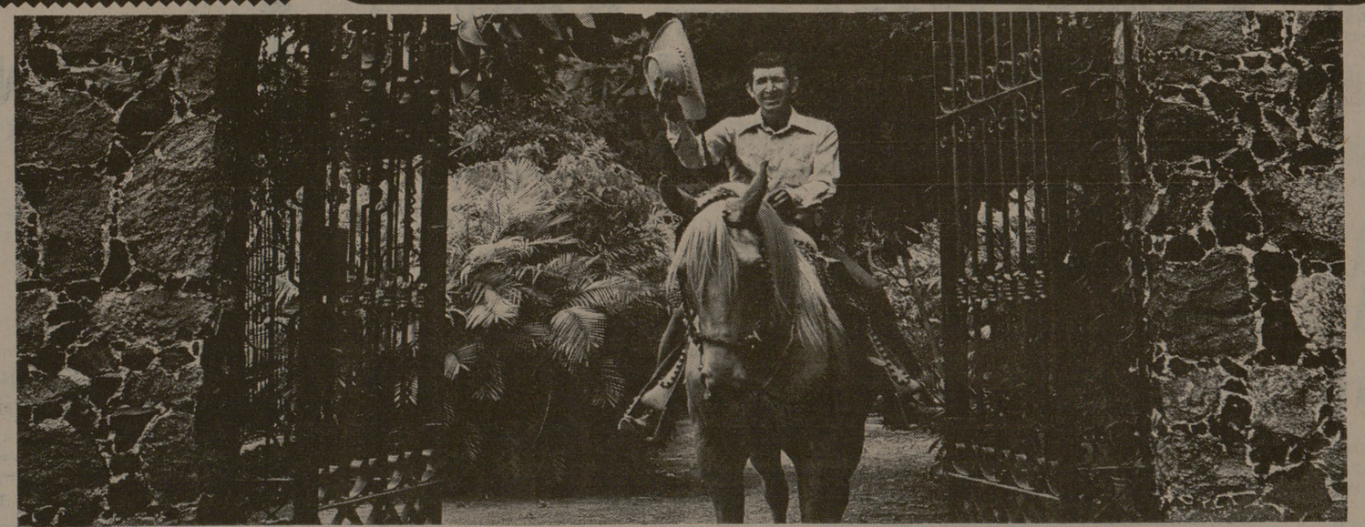
Next time you're in Mexico, stop by and visit the Cuervo fabrica in Tequila.

Since 1795 we've welcomed our guests with our best. A traditional taste of Cuervo Gold.