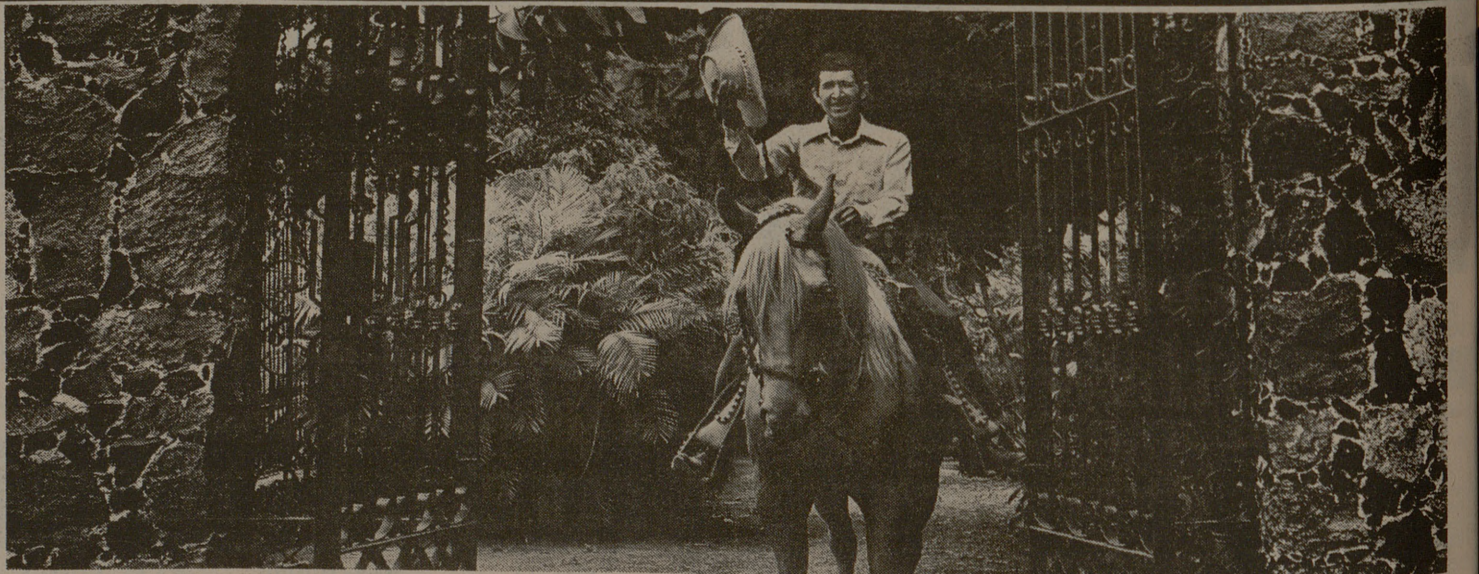
Next time you're in Mexico, stop by and visit the Cuervo fabrica in Tequila.

MAIN OFFICE: 2800 Texas Avenue • Bryan, Texas 77801 • 779-2800