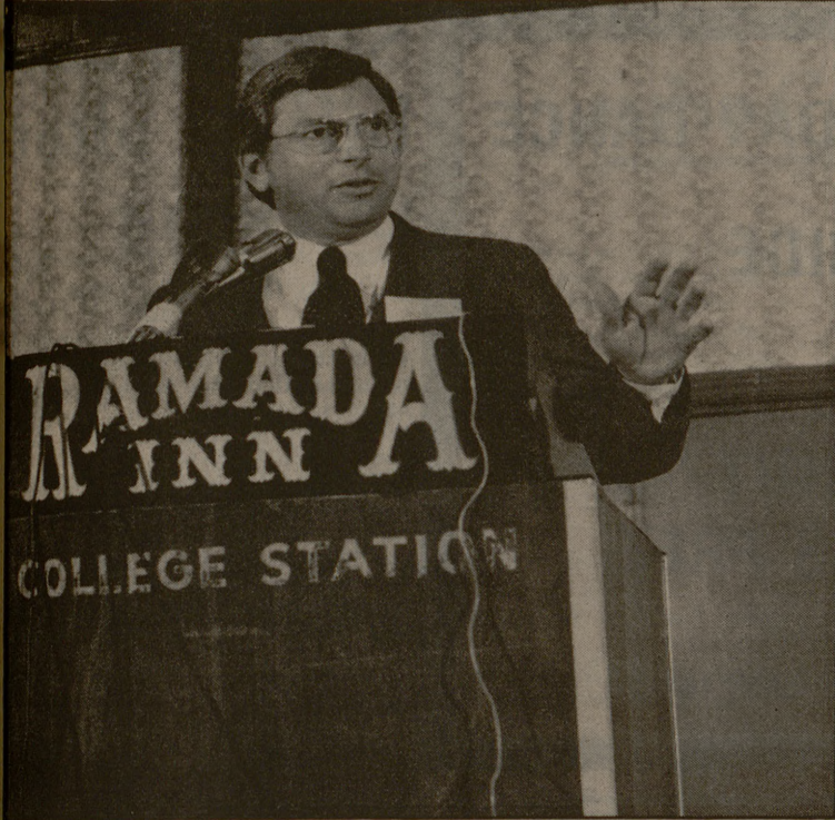
Texas Attorney General Mark White criticized government regulations in a speech given Wednesday to the 21st annual County Judges and Commissioners Conference in College Station.