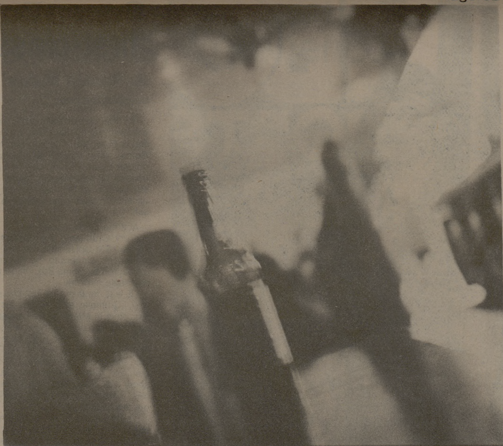
AFTER ALL THE DRINKING is done, some will see their last glimpse of the barroom in this manner. Let's hope this is not you; but then again, it never is.

—"What else is there to do in College Station?" And there's not much you can say to that.