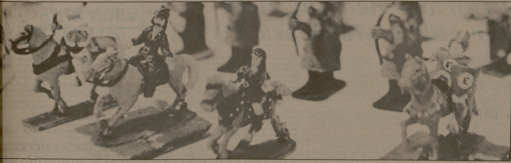
Toy soldiers, miniature battleships and imaginary wizards like these squared off at the