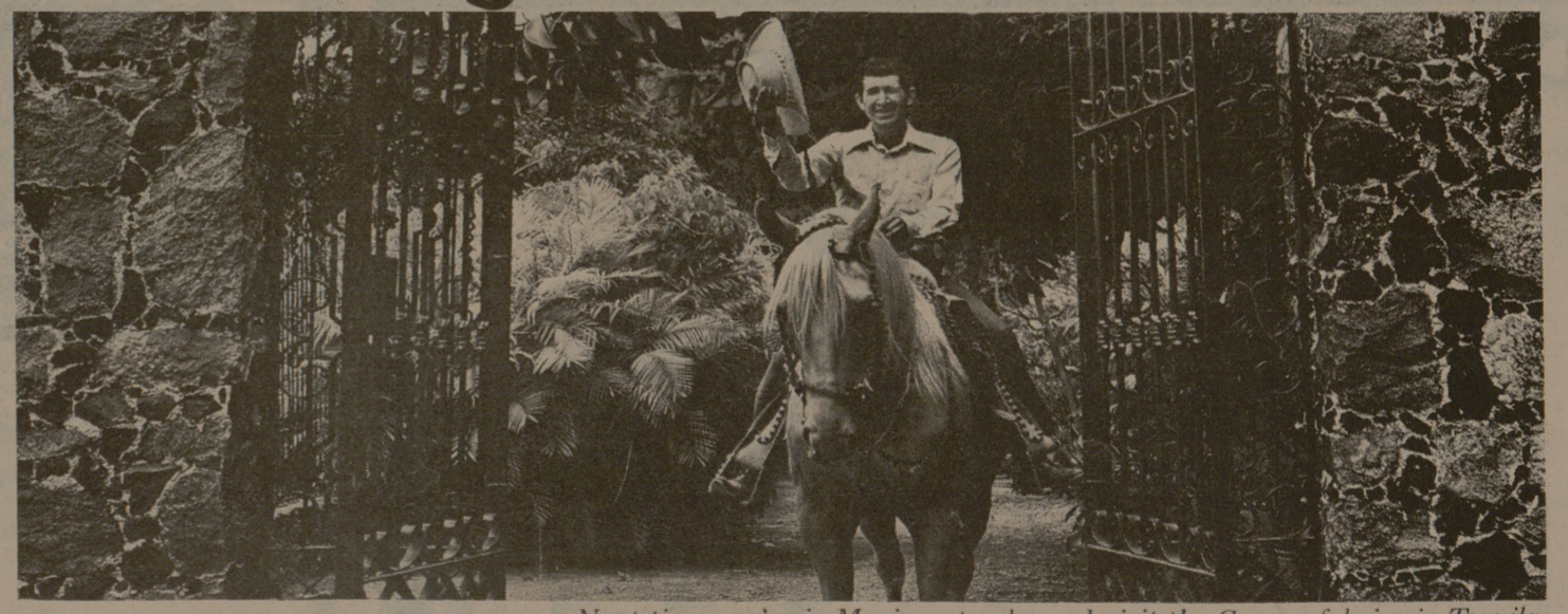
Next time you're in Mexico, stop by and visit the Cuervo fabrica in Tequila.