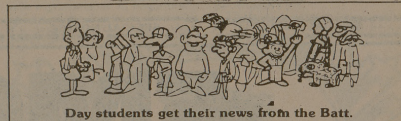
Day students get their news from the Batt.