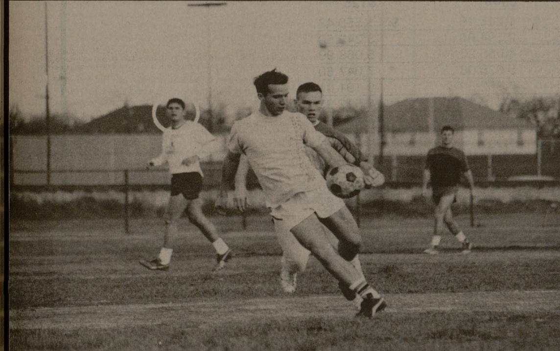
"I-Spy" Participant Of The Week