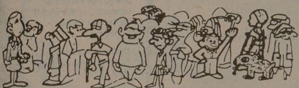
Day students get their news from the Batt.

Thursday, January 25, THIS WEEK! 8 P.M. College Station High School Aud. Tickets $2.00 Advance - $2.75 at door MSC Box Office