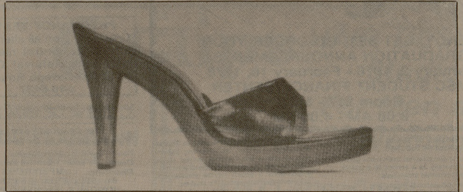
AMBER NAVY WHITE BEIGE