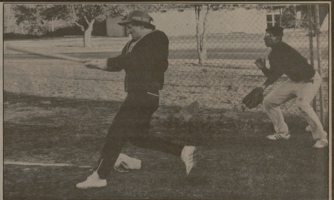
Here is a sample of the action available to you in softball this season.