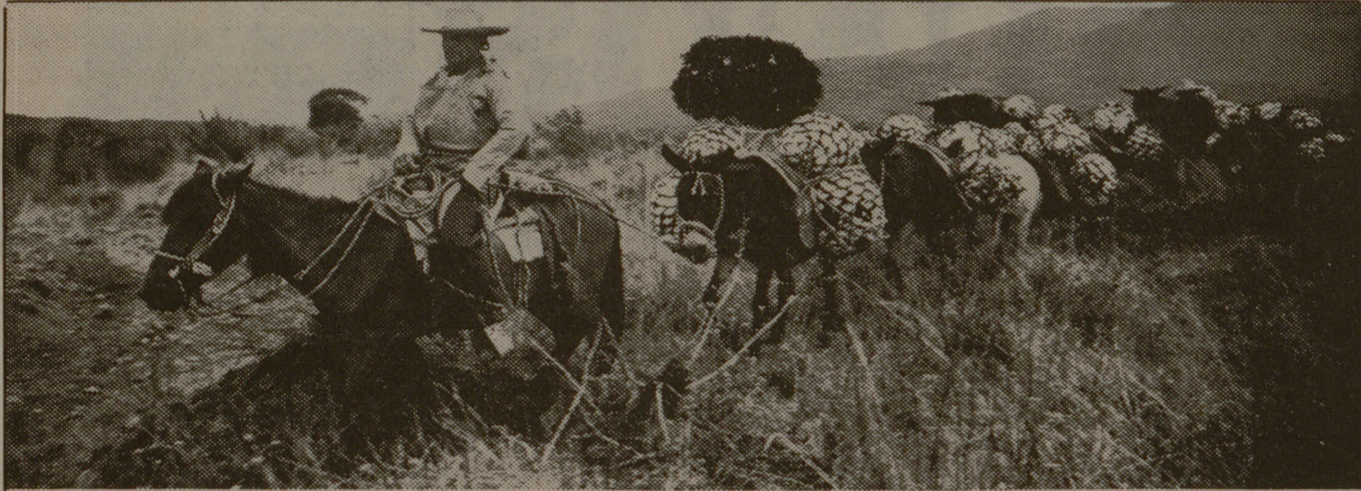
Mules laden with Blue Maguey pinas on their way to Cuervo's La Rojena plant.

December 29-30 the Aggies will be in Burlington, Vt., for the Vermont Classic. Cornell, Air Force and Vermont will join the Aggies for a two-day tournament.