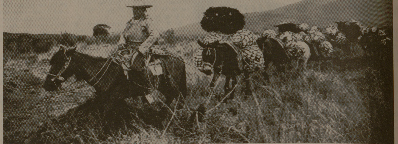
Mules laden with Blue Maguey pinas on their way to Cuervo's La Rojena plant.

The pace of action slows this week as the holidays approach. The top games of the week are SMU at home tonight against derbilb and Baylor hosting Texas at Paso Tuesday night. Next weekend will mark the beginning of tournament play. Bluebonnet Classic will feature Houston and Rice entering. Texas A&M will play in the Francisco Classic and Texas will be in the Birmingham Classic.