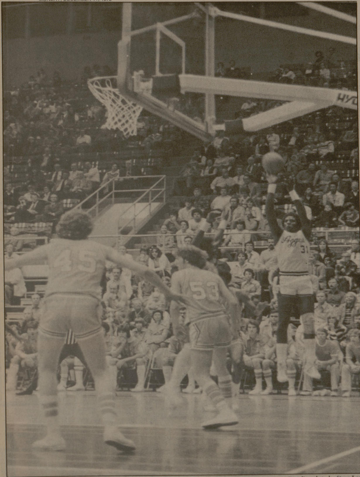
Taking his best shot