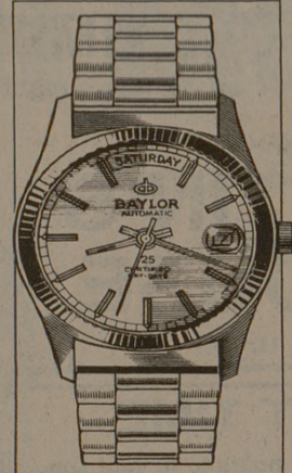
Automatic day/date watch with 25 jewels, $135