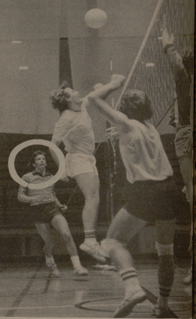
"I-Spy" Participant Of The Week