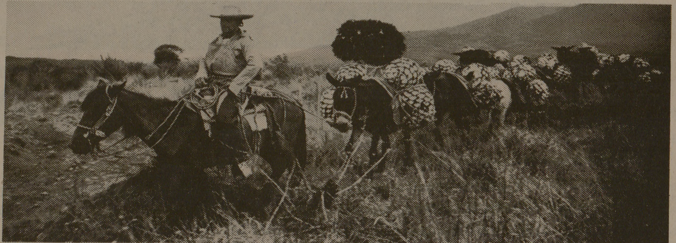
Mules laden with Blue Maguey pinas on their way to Cuervo's La Rojena plant.

Since 1795 we've gathered our Blue Magueys for Cuervo Gold the gentle way. It's the old way. And still the best.