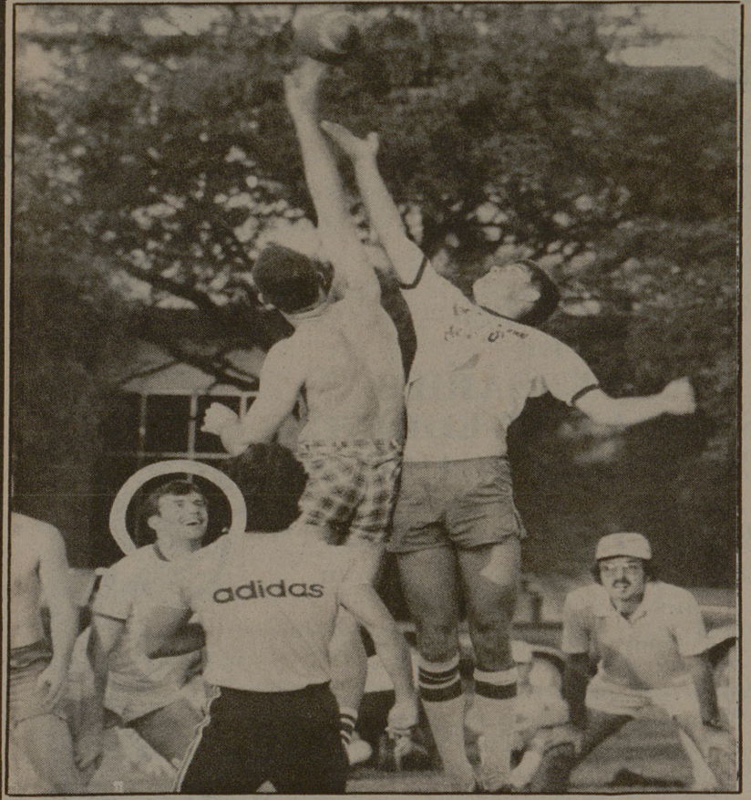
"I-Spy" Participant Of The Week

coach of the Saudi Arabian Olympic Team in 1976. The symposium will be held daily from 5:00 p.m. until dark, starting on Tues., Nov. 7 until Mon., Nov. 13. The Saturday session will neet all day. The location for all of these sessions may vary. Information can be obtained through contacting the Intramural Office in DeWare Fieldhouse, 845-7826.