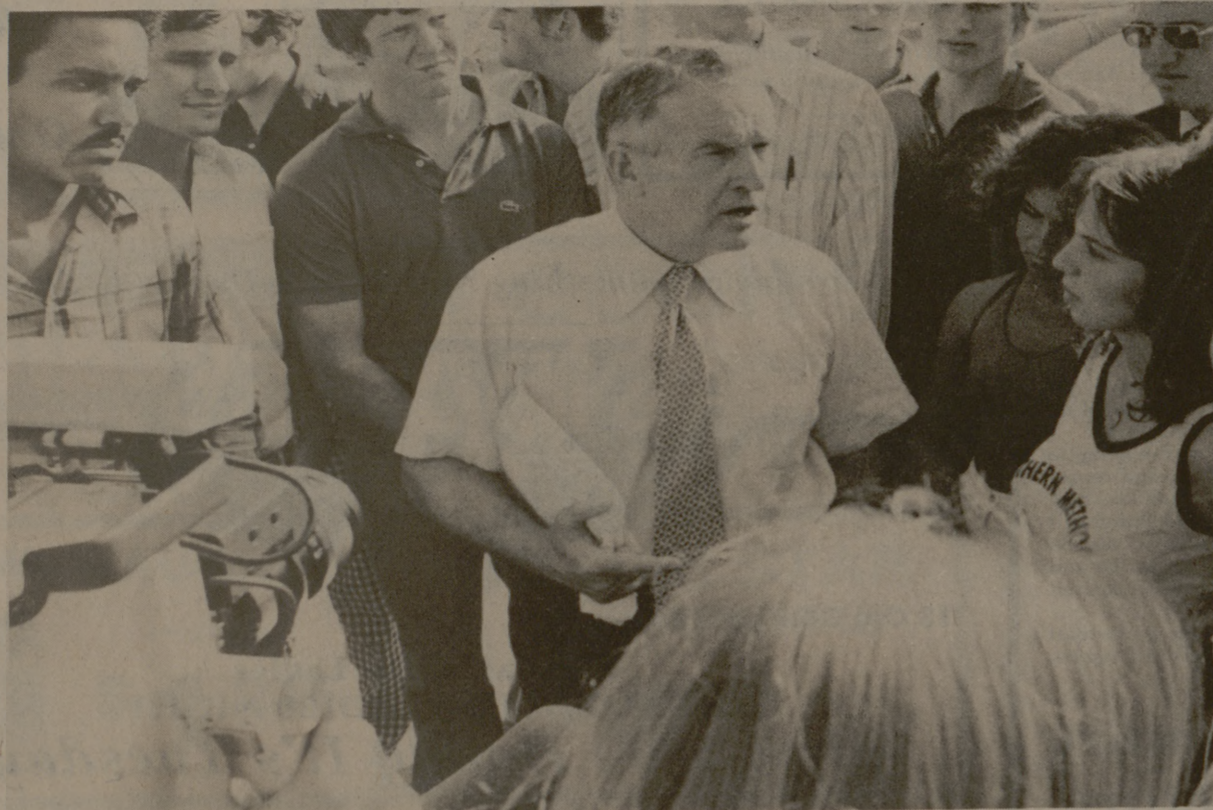
21 Student Body Presidents and more than 150 student leaders from 53 Texas Colleges have joined the Students for Clements Steering Committee.