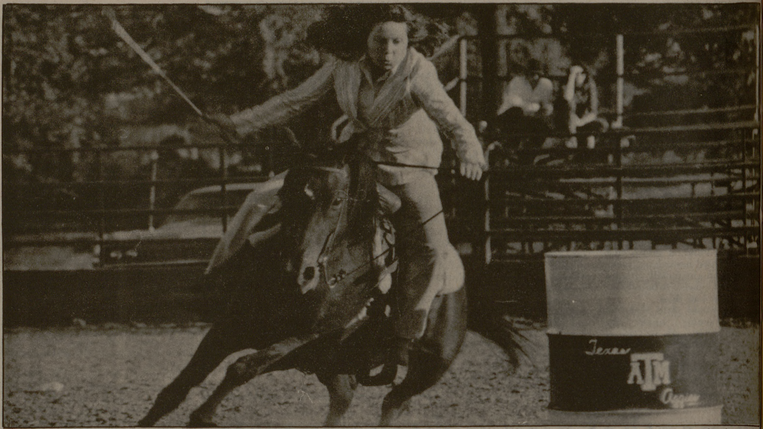
Barrel racin' Aggie wins; benefit planned