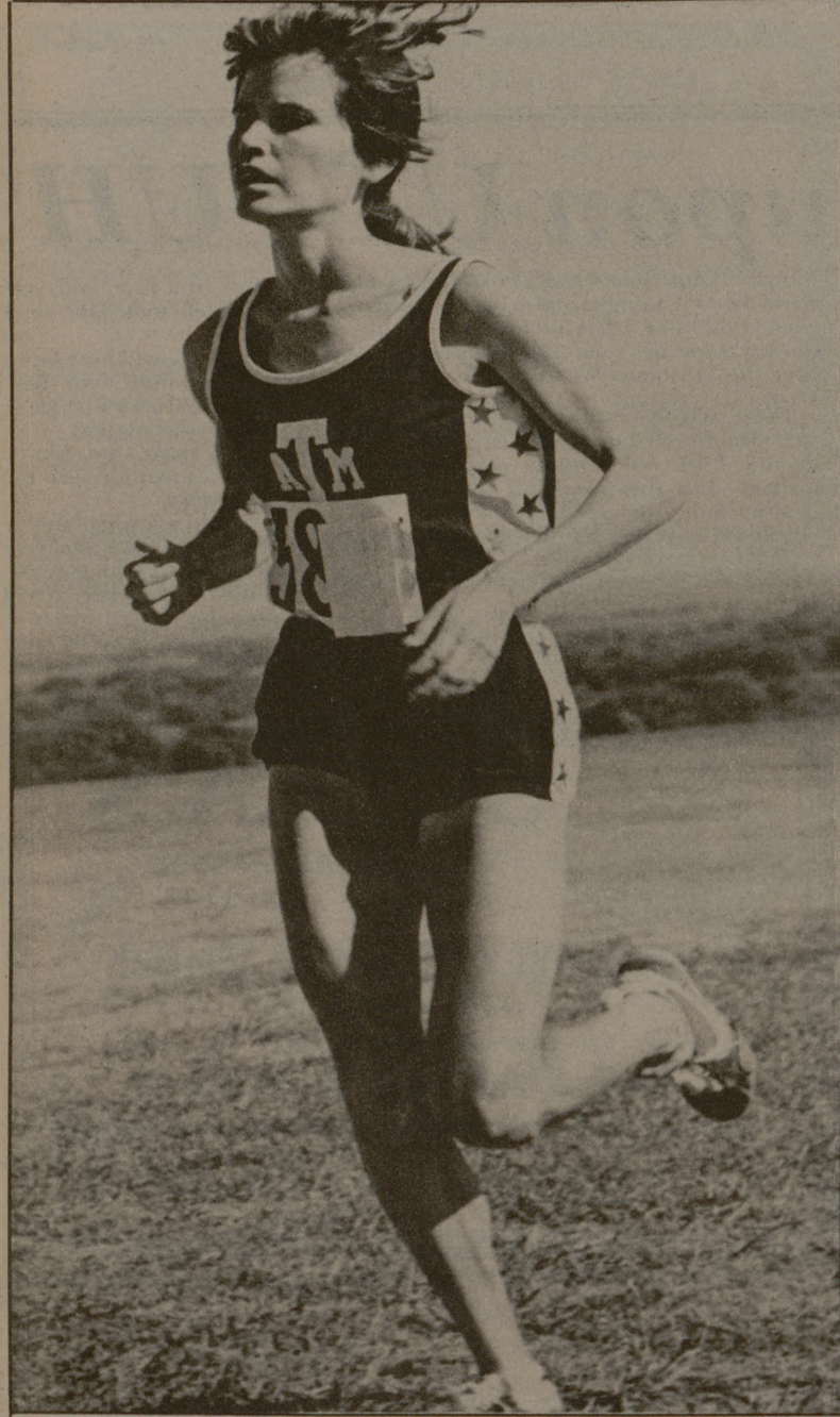
Battalion